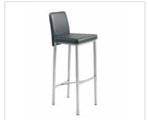
AVA BAR H80 (432.H80)