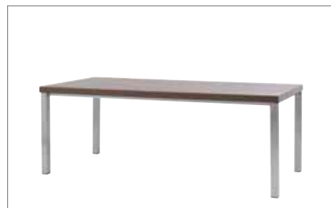
Table Xander available in H42/H74/H90/H110 cm