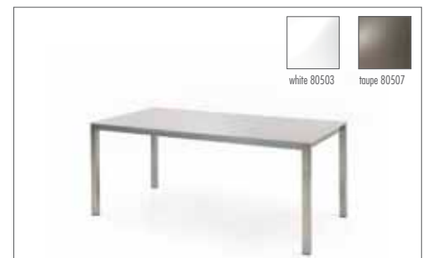
Table Xander available in H42/H74/H90/H110 cm