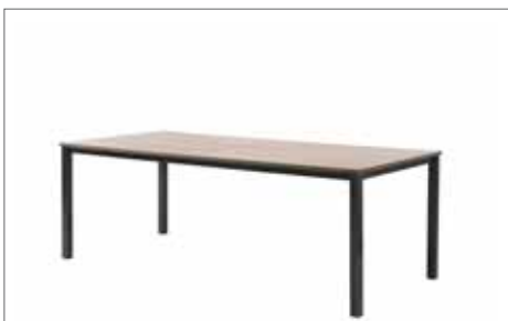
Table Xander available in H42/H74/H90/H110 cm