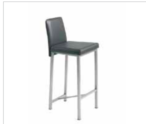
AVA BAR H67 (432.H67)