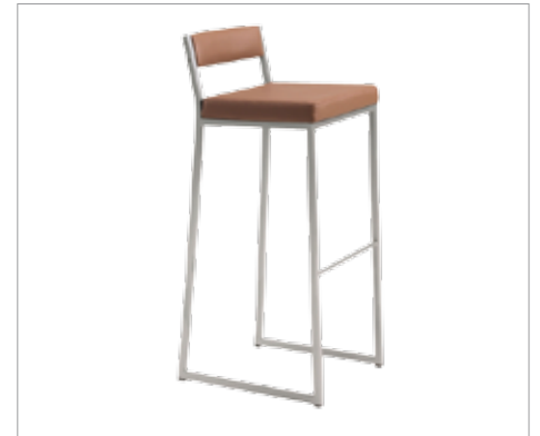
OSLO BAR H80 (486 H80)