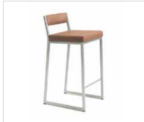
OSLO BAR H67 (486 H67)