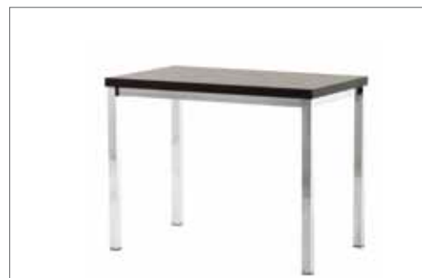
Table Xander available in H42/H74/H90/H110 cm