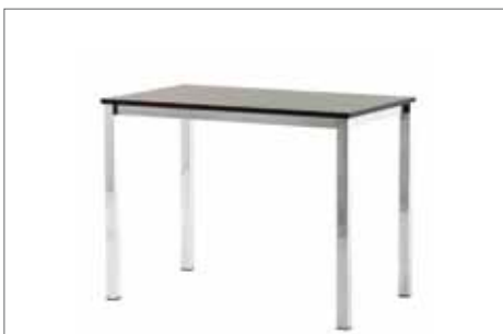
Table Xander available in H42/H74/H90/H110 cm