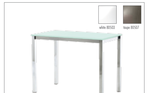
Table Xander GLS available in H42/H74/H90/H110 cm